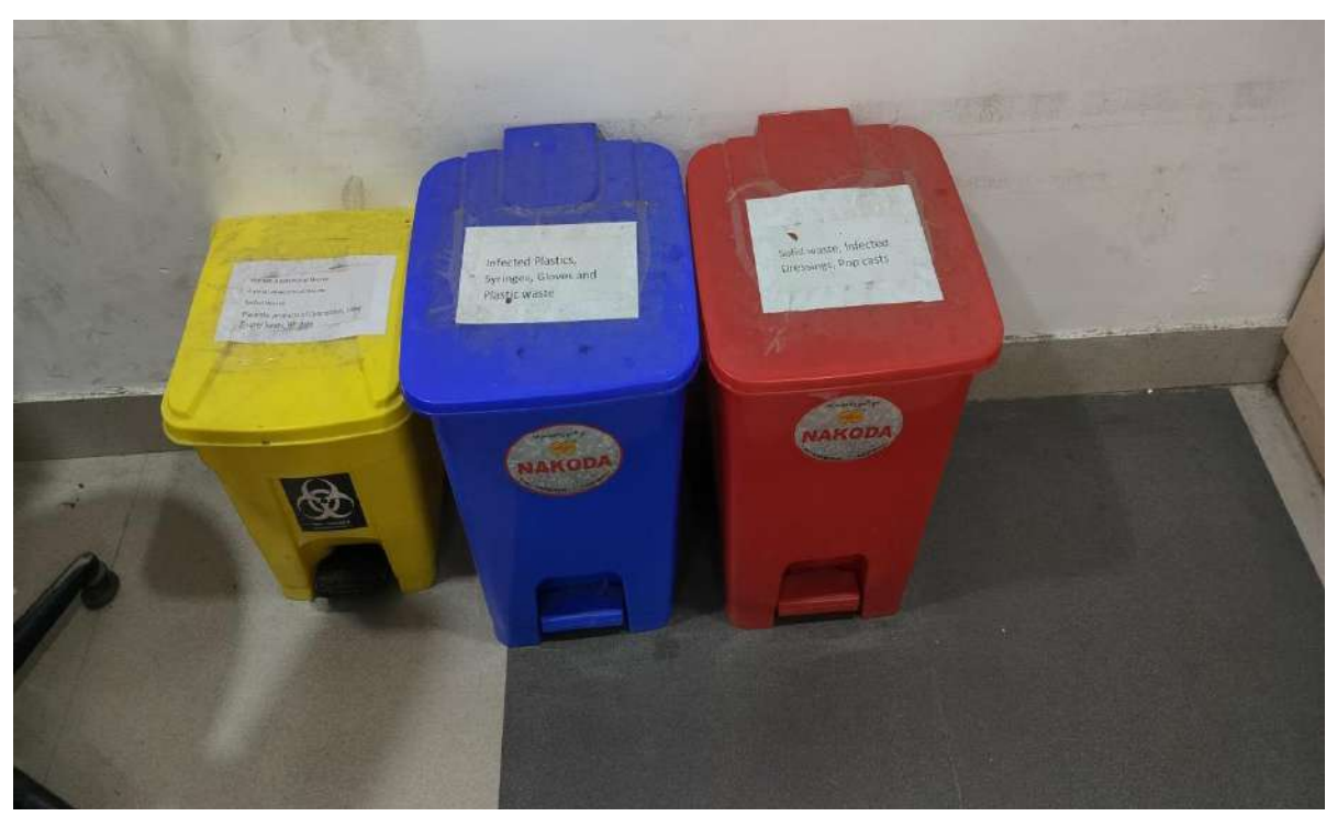
Colour coded bins for biomedical waste