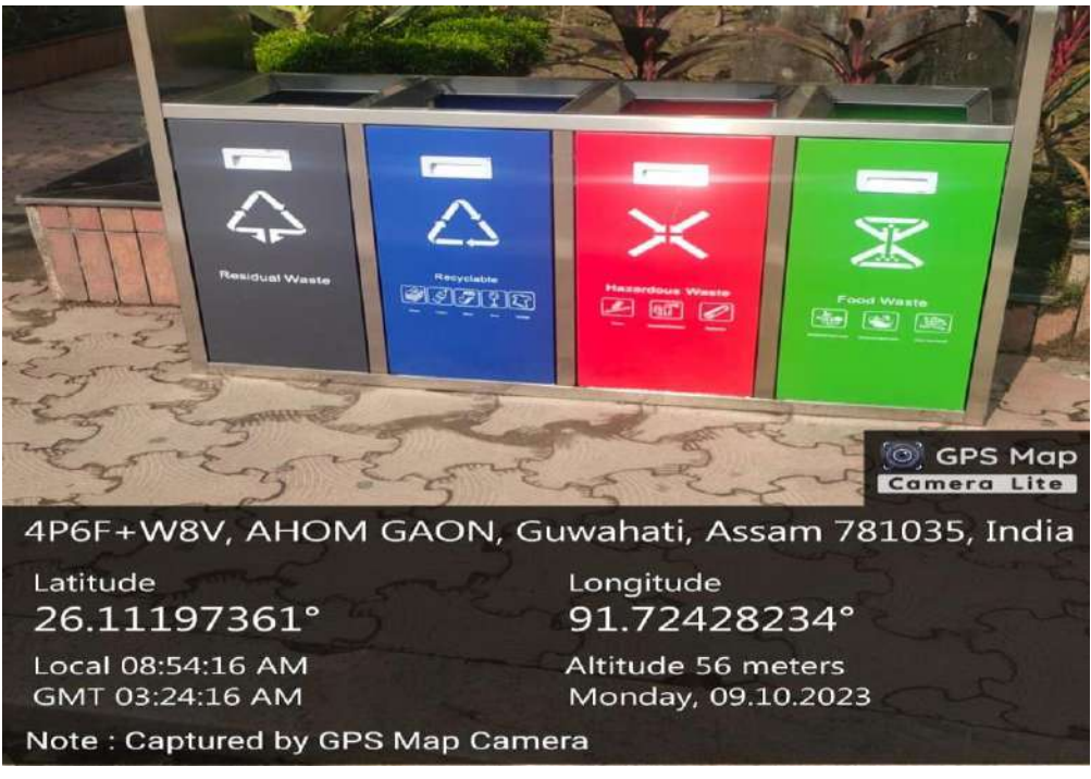
Colour Coded dustbins installed at strategic places for effective waste segregation and disposal.