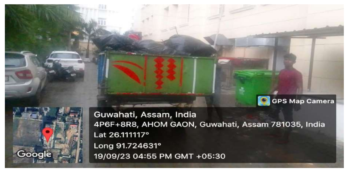
Collection of solid waste