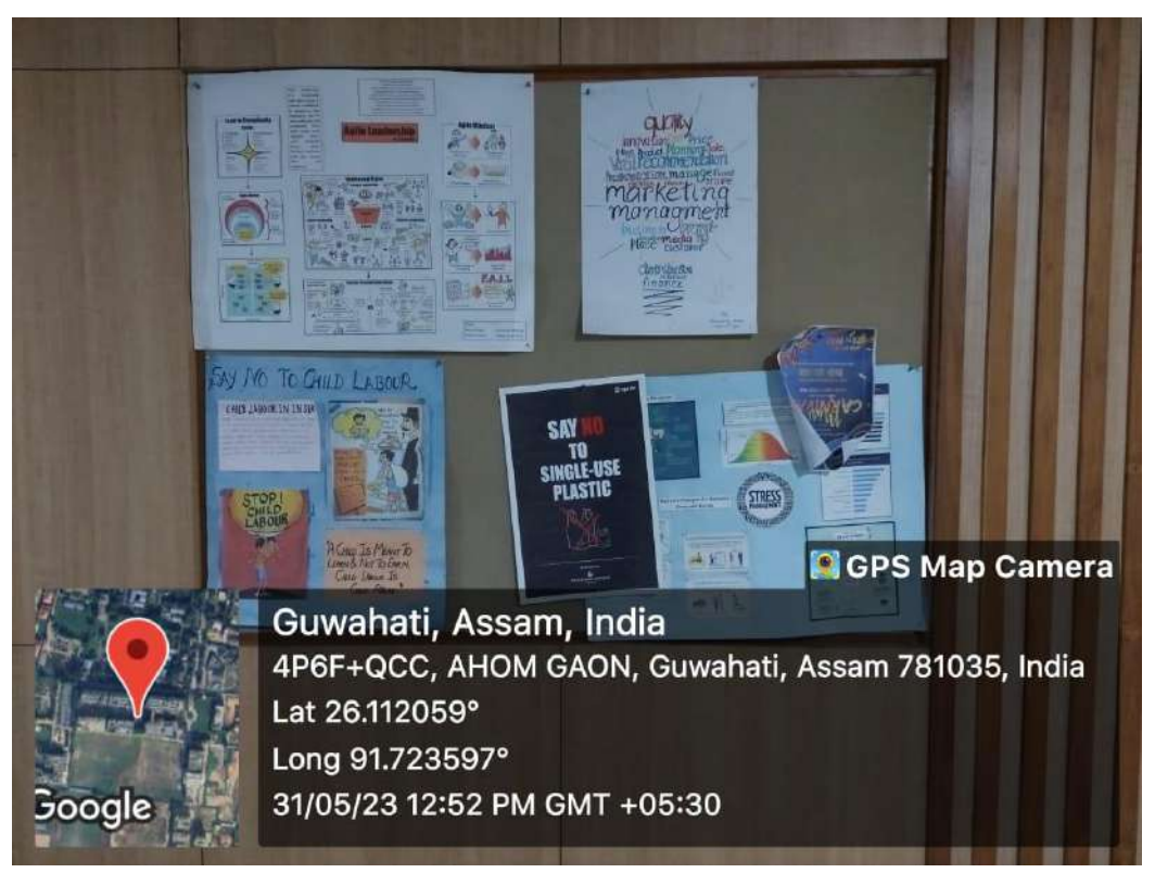
Awareness on Ban on single-use plastic University Notice Boards