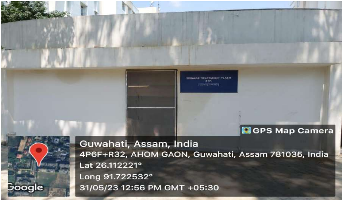
Sewage Treatment Plant is installed behind Amphitheatre

The University has a Sewage Treatment Plant (STP) to effectively treat liquid waste. The recycled water is utilized for various purposes such as gardening, flushing toilets etc.