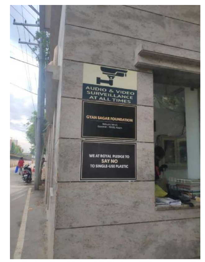
Say No to Single Use Plastic signage at the entrance of the University

Single use plastic items such as plastic bottles, bags, spoons, straws and cups are banned completely and awareness is created among students and staff of University.