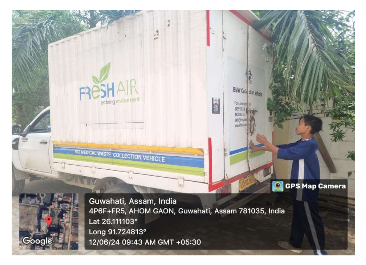
Biomedical waste collected for disposal

The University has signed an MoU with Fresh Air Waste Management Services Pvt Ltd., Guwahati for the treatment of biomedical waste. The waste is segregated in colour coded waste bins and label system.